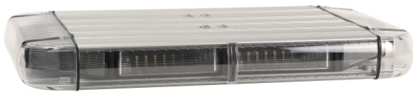
7200 Series 22" STAR Laser® Mini-bar